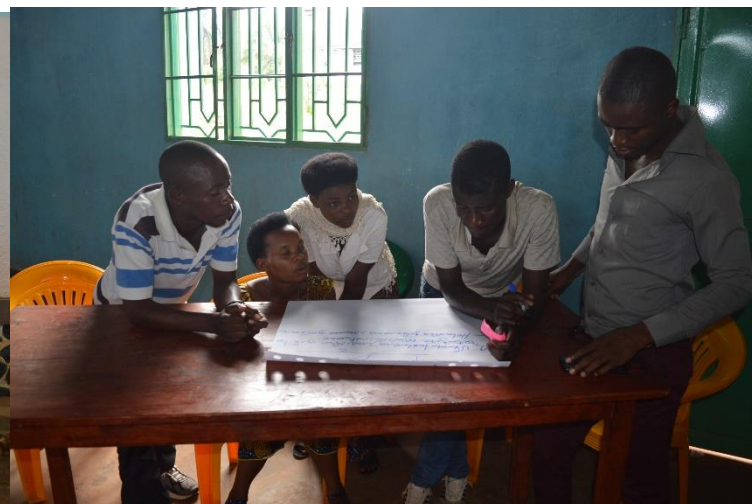
working group assistance